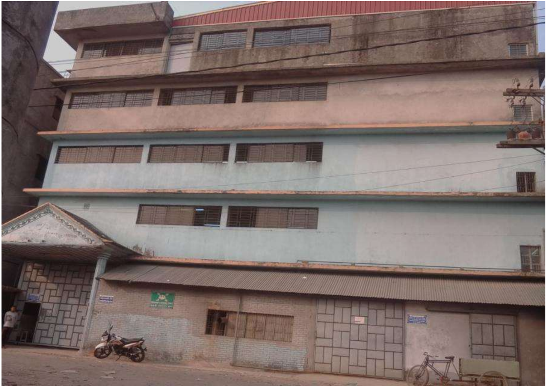
FACTORY FRONT VIEW