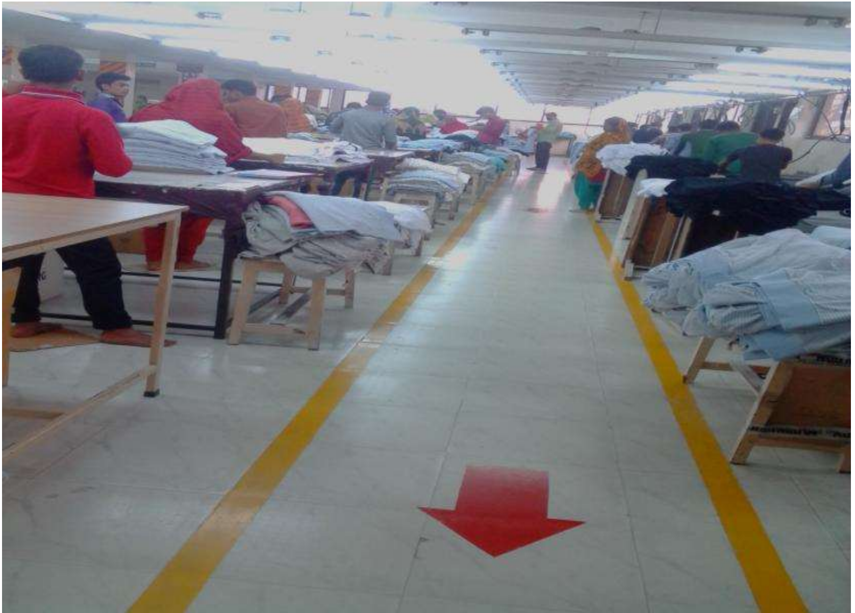
IRONING & FINISHING SECTION